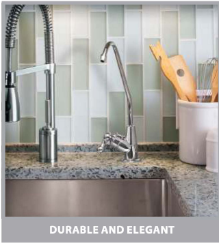
DURABLE AND ELEGANT